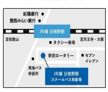
JR Hineno Station 9:02